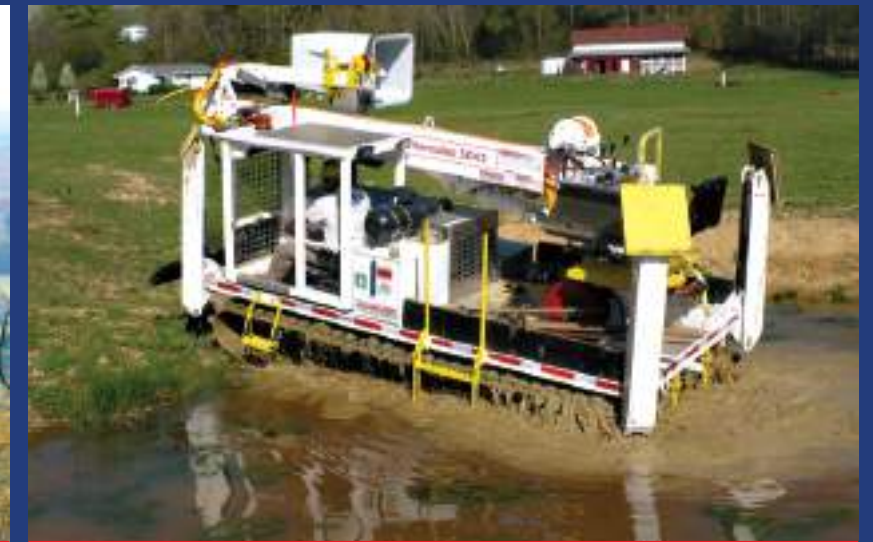
Low ground pressure means excellent flotation on soft ground