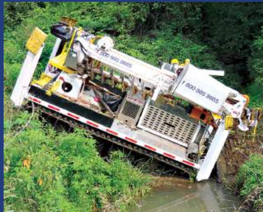
The Achiever's advanced track and suspension design and powerful engine allow it to go almost anywhere