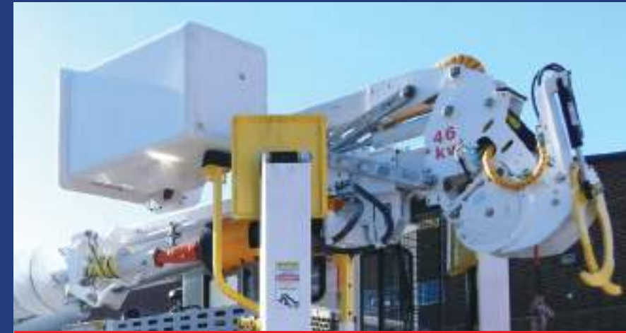
6,000 lb boom tip winch On fiberglass 3 rd boom, Insulated