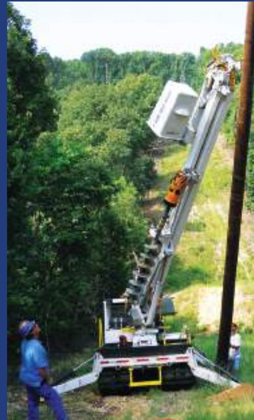
The Achiever can set up to 70' poles