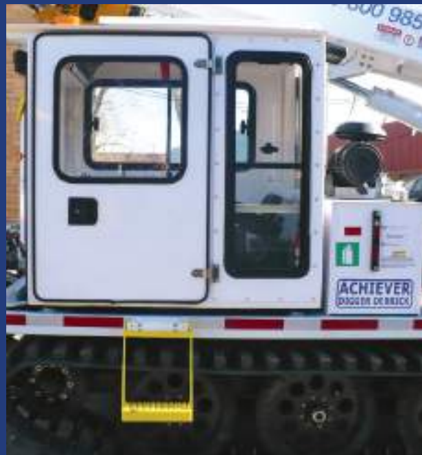
The optional closed cab comes with a front wiper, heater and two opening windows