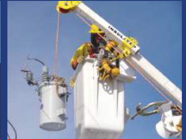
The optional material handling jib can lift up to 600 lbs