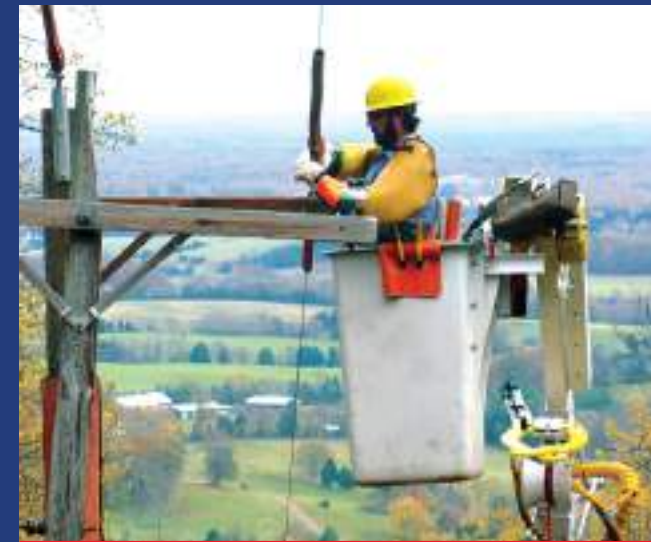
The insulated bucket has a 47' reach and comes with full pressure controls and an optional tool outlet and jib