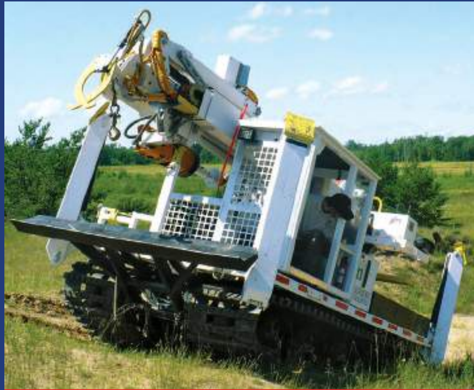
The only derrick on the market that can climb a 40 degree slope with a low center of gravity to provide excellent sideslope stability