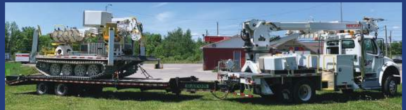
RT-02 DD Tracked Digger Derrick is easily transportable to jobsite on a dual axle trailer behind a single axle bucket truck