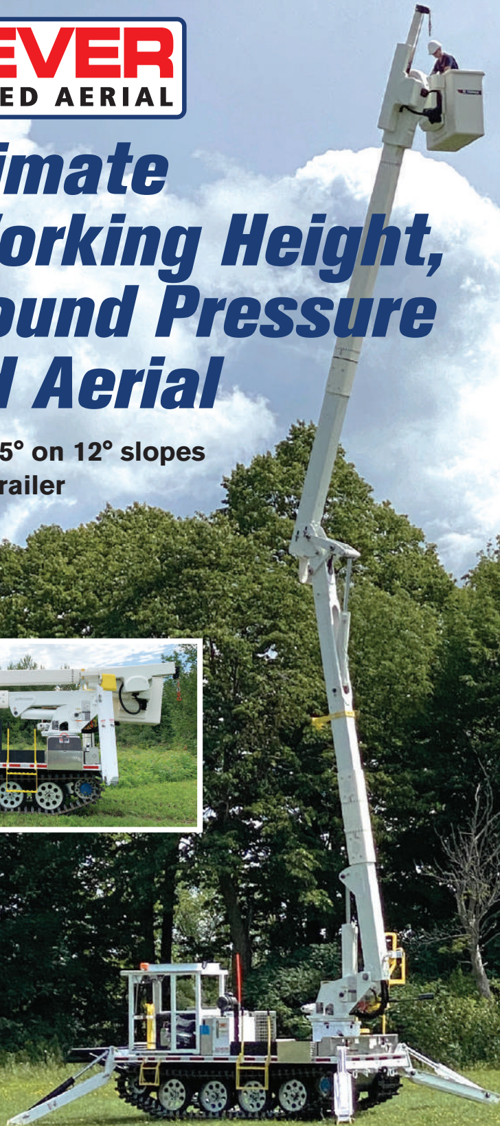
UTV Achiever Carrier with a Terex Optima TC-55 High Ranger